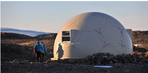
A fibre glass pod at the White Desert hotel camp in Antarctica

Counting Prince Harry as a former guest, the all inclusive hotel is only open for five weeks a year across the summer months of November and December.