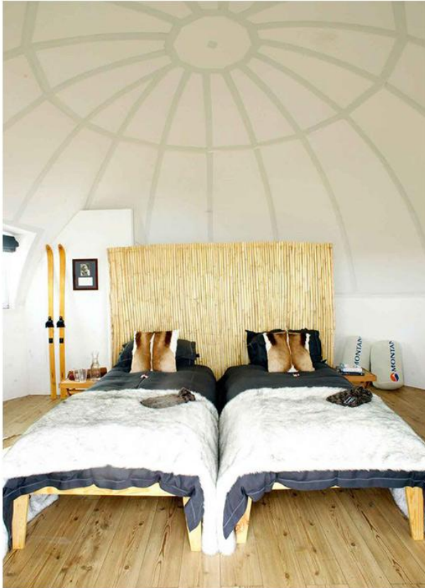
A sleeping pod pictured at the White Desert hotel in Antarctica

But if there's a blizzard, it can see guests out of action for around three days. Even if you're forced to stay indoors, guests can expect just a handful of others to mingle with, with the hotel only accepting 12 guests at one time.