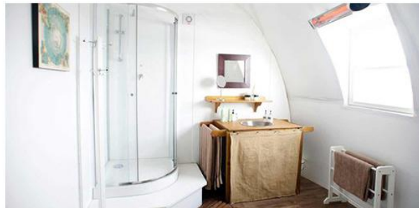
A lounge room pictured at the White Desert hotel in Antarctica