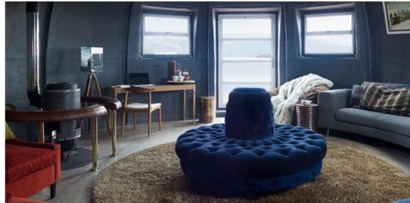
A lounge room pictured at the White Desert hotel in Antarctica