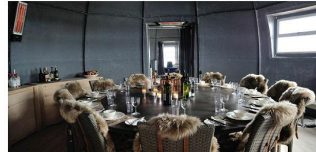
A living room area pictured at the White Desert hotel in Antarctica