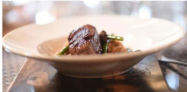
Food served at the White Desert hotel in Antarctica

"All the materials, fixtures and fittings had to be flown in at a cost of £12.50 a kilo and then transported across a crevasse-ridden route on a specialised 4x4," he said, with each of the sleep pods weighing three tones.