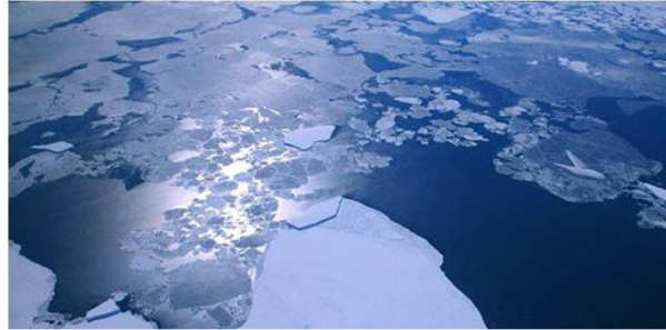
An aerial view of ice floes in Antarctica

Revealing why the opulent hotel carries such a hefty bill, its founder Patrick Woodhead told The Times that the upgrade has been extremely expensive due to the remote location.